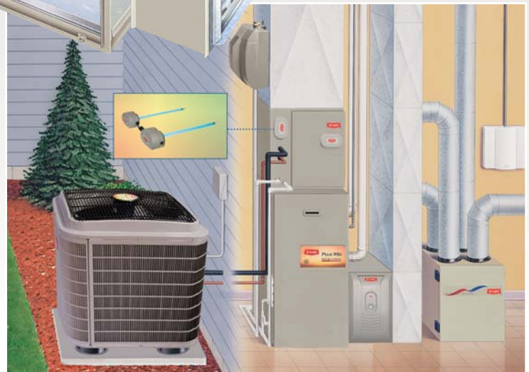
HYBRID HEAT® Deluxe Heat Pump and Deluxe Gas Furnace System