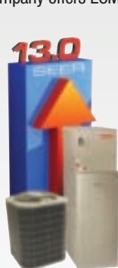
Select 13 SEER Bryant air conditioner and select Bryant evaporator coil paired with typical gas furnace

Unlike typical furnaces, the Plus 90x gas furnace can enhance the efficiency of selected Bryant air conditioners during cooling season.* The secret is the electronically controlled, variable speed ECM blower motor. This motor quietly and efficiently delivers conditioned air throughout the home during both heating and cooling modes, which can increase the efficiency of your air conditioner and thus result in lower year-round utility costs and may even help you qualify for regional rebates. Your dealer can help you determine if your local utility company offers ECM motor incentives.