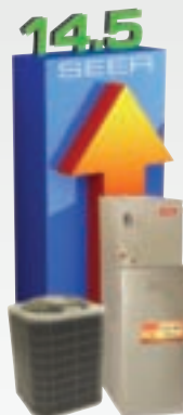
Same air conditioner and evaporator coil paired with the Plus 90x

*As compared to the Air-Conditioning, Heating and Refrigeration Institute's standard coil-only rating when paired with selected Bryant evaporator coils.